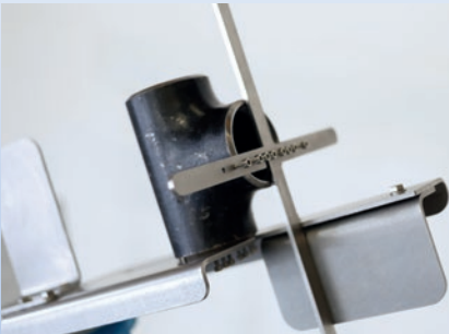
Pipe Fitting Center Finder