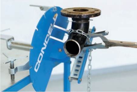
Pipe Alignment Vice